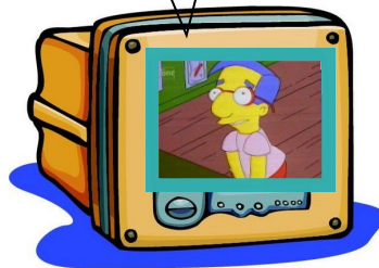
Today's screened Maths moment

Mrs. Krabappel: Now whose calculator can tell me what 7 \times 8 is? Millhouse: Oh! Oh! Oh! 'Low Battery.' Mrs. Krabappel (sighs): Whatever.