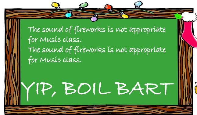
Today's Chalkboard Anagram (1 word)